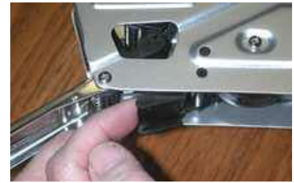
Pull down on the forward part of the printbase. This will open the path for the labels to pass through