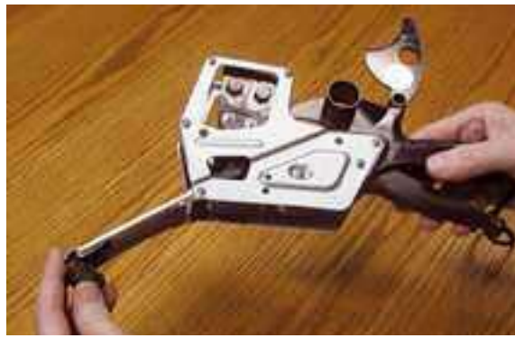
Ready to load